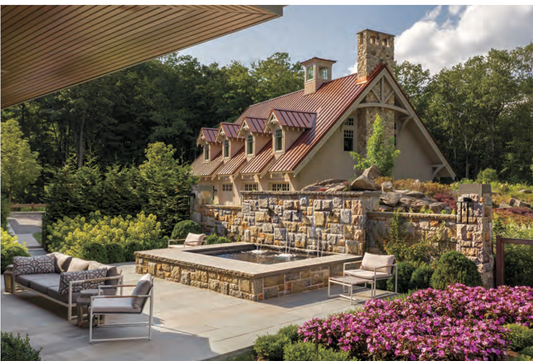
Resplendant Greenscape (CLOCKWISE ACROSS SPREAD FROM THIS PAGE TOP) Janice Parker Landscape Architects designed the property with plantings primarily in shades of green and white with en masse groupings of impatiens providing shots of color. The infinity pool is also Parker's design. The pool house seating, dining table and chairs are from Harbour Outdoor. In the tower room, Century chairs wearing Travers fabric circle a Hickory Chair cocktail table; the chandelier is from Visual Comfort. The spa is intentionally separated from the main pool and is a designated adult area. See Resources.

Selecting shingles because they "improve with age as they get patina," Hanlon adds, "Things like overhangs and brackets also fare better than crisper modern details that are hard to maintain." The local vernacular played a role as well. Granite walls in shades of beige, brown, gray and a hint of pink offer a dressed up version of the area's farm fences, and the rusticated timber frame barn with vertical cedar siding and exposed rafter tails further references the adjacent farm properties.